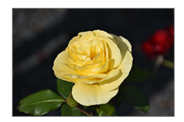
High Voltage Rose flowers