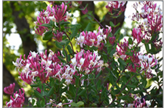
Peaches And Cream Honeysuckle flowers

This woody vine does best in full sun to partial shade. It does best in average to evenly moist conditions, but will not tolerate standing water. It is not particular as to soil type or pH. It is somewhat tolerant of urban pollution. Consider applying a thick mulch around the root zone in winter to protect it in exposed locations or colder microclimates. This is a selection of a native North American species.