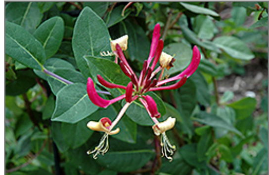
Peaches And Cream Honeysuckle flowers