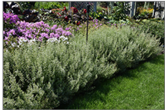
Montrose White Dwarf Calamint in bloom