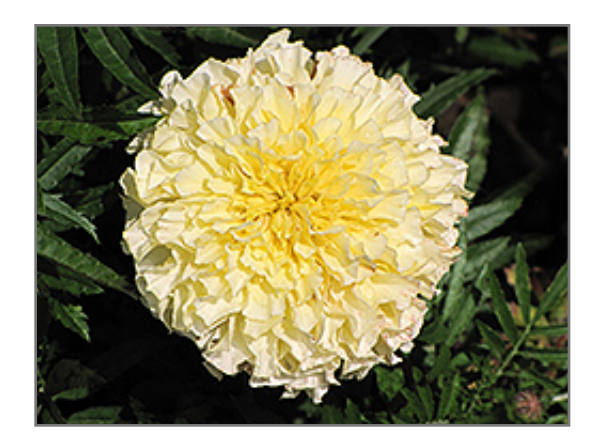
Vanilla Marigold flowers

3352 N Service Dr. Red Wing, MN, 55066 phone: 651-388-3847 www.sargentsnursery.com