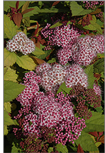
Double Play Big Bang Spirea flowers