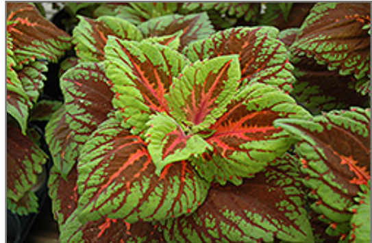
Kong Salmon Pink Coleus foliage