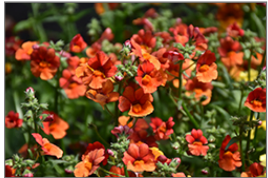
Sunsatia Blood Orange Nemesia flowers