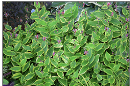
Autumn Glow Toad Lily in bloom