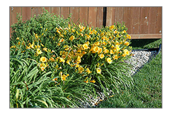
Stella de Oro Daylily in bloom