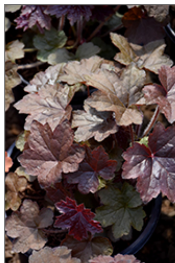
Palace Purple Coral Bells foliage