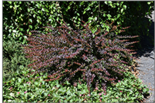
Lava Nugget Barberry