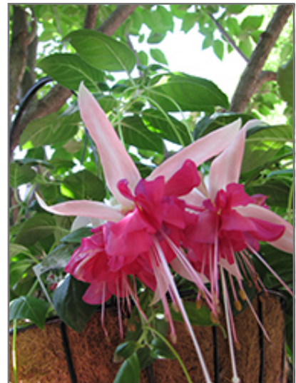
Bella Rosella Fuchsia flowers