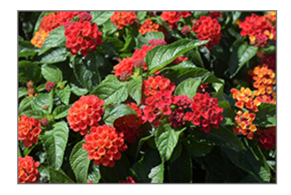
Bloomify Red Lantana flowers