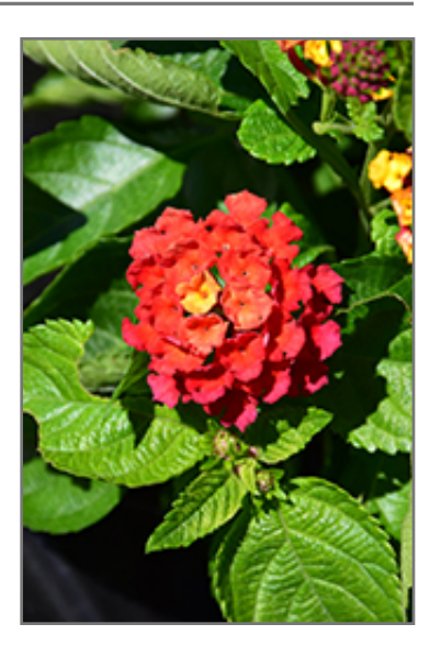
Bloomify Red Lantana flowers