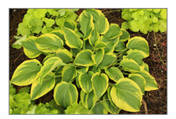
Twin Cities Hosta