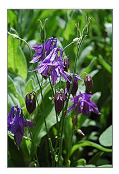
Alpine Columbine flowers