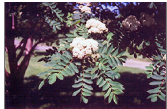
Showy Mountain Ash flowers