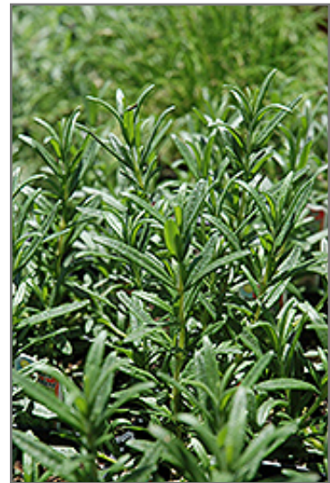
Spice Islands Rosemary foliage