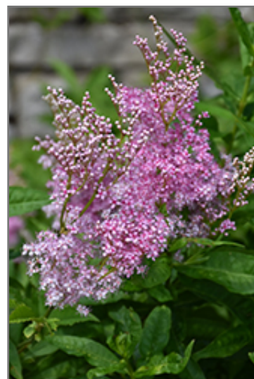
Venusta Queen Of The Prairie flowers