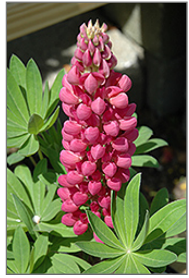
Minarette Mix Lupine flowers