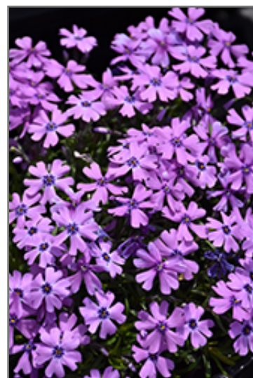
Purple Beauty Moss Phlox flowers

Purple Beauty Moss Phlox is recommended for the following landscape applications;