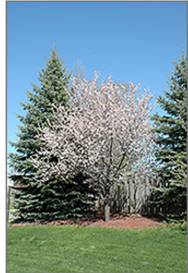
Newport Plum in bloom

This tree should only be grown in full sunlight. It does best in average to evenly moist conditions, but will not tolerate standing water. It is not particular as to soil type or pH. It is highly tolerant of urban pollution and will even thrive in inner city environments. This is a selected variety of a species not originally from North America.