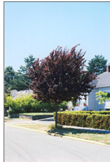
Newport Plum