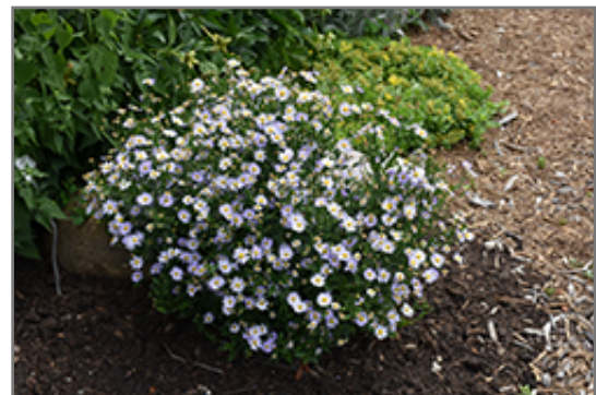
Blue Star Japanese Aster in bloom