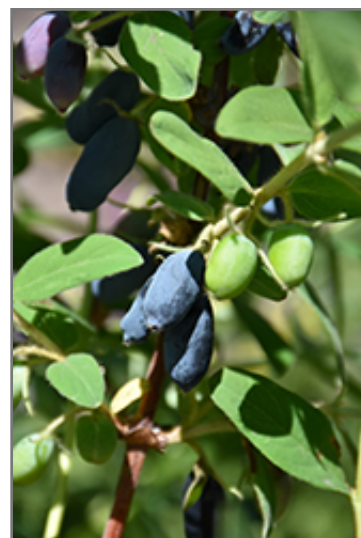
Cinderella Honeyberry fruit

Aside from its primary use as an edible, Cinderella Honeyberry is suitable for the following landscape applications;