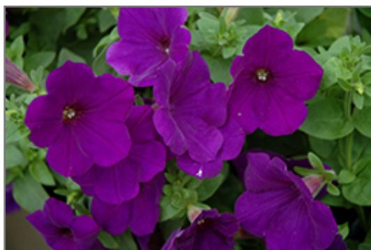
Supertunia Royal Velvet Petunia flowers