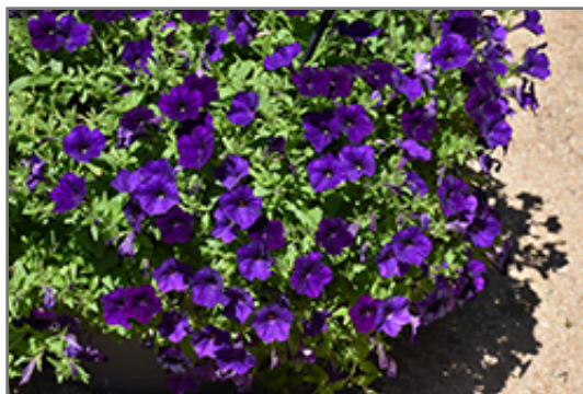
Supertunia Royal Velvet Petunia flowers