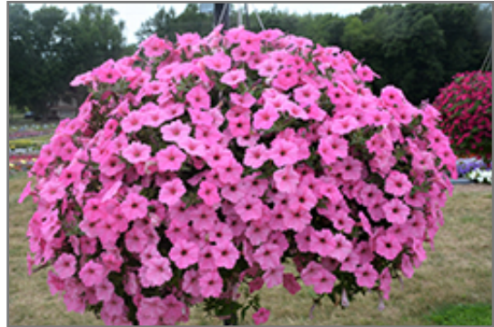
Supertunia Vista Bubblegum Petunia in bloom

Supertunia Vista Bubblegum Petunia is a fine choice for the garden, but it is also a good selection for planting in outdoor containers and hanging baskets. Because of its trailing habit of growth, it is ideally suited for use as a 'spiller' in the 'spiller-thriller-filler' container combination; plant it near the edges where it can spill gracefully over the pot. Note that when growing plants in outdoor containers and baskets, they may require more frequent waterings than they would in the yard or garden.