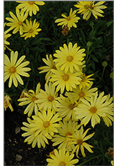
Voltage Yellow African Daisy flowers