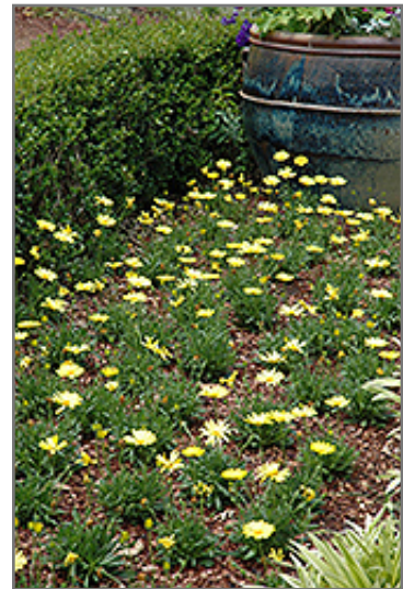
Voltage Yellow African Daisy flowers