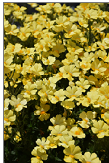
Sunsatia Lemon Nemesia flowers

Sunsatia Lemon Nemesia will grow to be about 10 inches tall at maturity, with a spread of 18 inches. When grown in masses or used as a bedding plant, individual plants should be spaced approximately 12 inches apart. Its foliage tends to remain low and dense right to the ground. This fast-growing annual will normally live for one full growing season, needing replacement the following year.