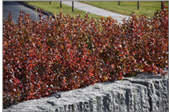
Gro-Low Fragrant Sumac in fall

This shrub performs well in both full sun and full shade. It is very adaptable to both dry and moist locations, and should do just fine under typical garden conditions. It is not particular as to soil type, but has a definite preference for acidic soils, and is subject to chlorosis (yellowing) of the foliage in alkaline soils. It is highly tolerant of urban pollution and will even thrive in inner city environments. Consider applying a thick mulch around the root zone in winter to protect it in exposed locations or colder microclimates. This is a selection of a native North American species.