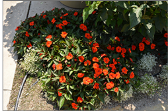
SunPatiens Compact Orange New Guinea Impatiens in bloom

SunPatiens Compact Orange New Guinea Impatiens will grow to be about 24 inches tall at maturity, with a spread of 24 inches. When grown in masses or used as a bedding plant, individual plants should be spaced approximately 20 inches apart. Its foliage tends to remain dense right to the ground, not requiring facer plants in front. This fast-growing annual will normally live for one full growing season, needing replacement the following year.