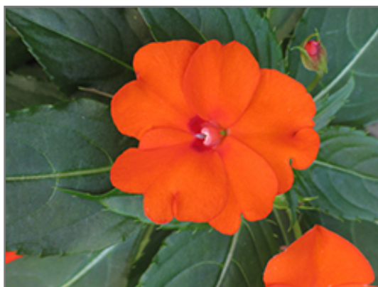
Infinity Orange New Guinea Impatiens flowers

Infinity Orange New Guinea Impatiens is recommended for the following landscape applications;