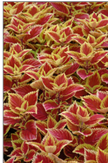
Trusty Rusty Coleus foliage