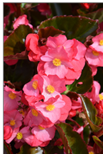
Big Rose Bronze Leaf Begonia flowers

Big Rose Bronze Leaf Begonia is recommended for the following landscape applications;