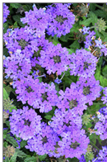
Superbena Royale Chambray Verbena flowers