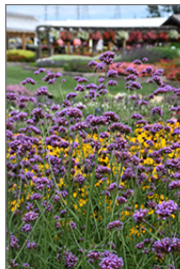
Buenos Aires Verbena flowers