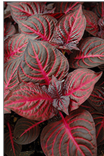
Blazin' Rose Blood Leaf foliage