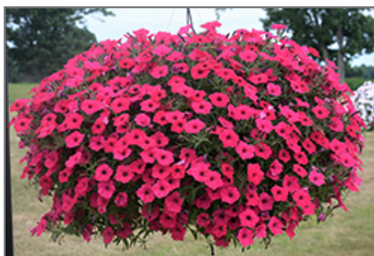
Supertunia Vista Fuchsia Petunia in bloom