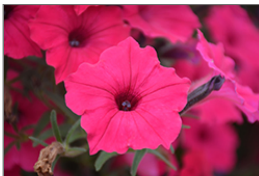
Supertunia Vista Fuchsia Petunia flowers