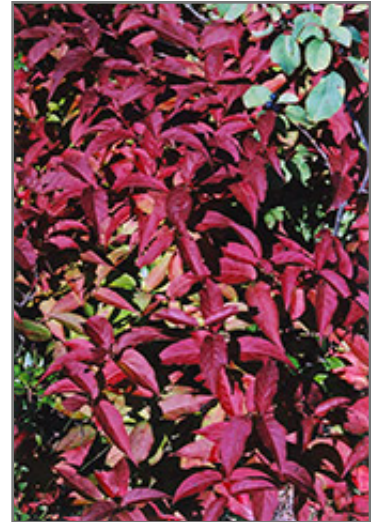
Bush Honeysuckle in fall

This shrub does best in full sun to partial shade. It is very adaptable to both dry and moist locations, and should do just fine under average home landscape conditions. It is not particular as to soil type or pH. It is highly tolerant of urban pollution and will even thrive in inner city environments. This species is native to parts of North America.