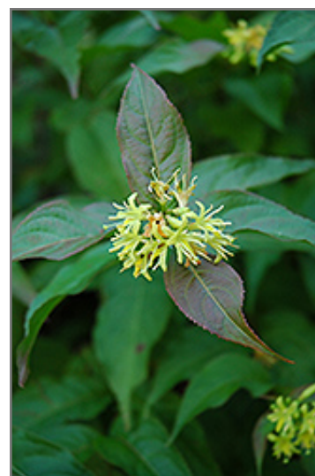
Bush Honeysuckle flowers