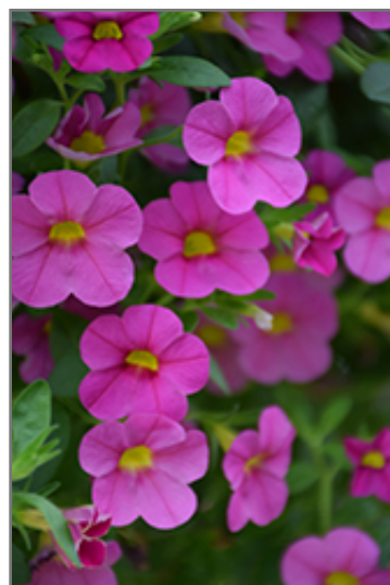
Superbells Pink Calibrachoa flowers

Superbells Pink Calibrachoa is recommended for the following landscape applications;