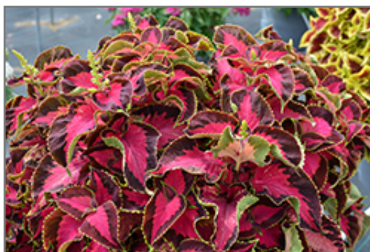
Chocolate Covered Cherry Coleus foliage