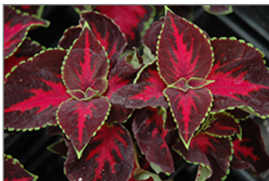
Chocolate Covered Cherry Coleus foliage