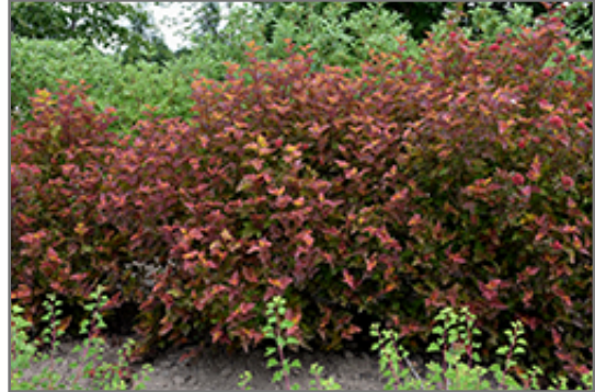
Amber Jubilee Ninebark

This shrub does best in full sun to partial shade. It is very adaptable to both dry and moist locations, and should do just fine under average home landscape conditions. It is not particular as to soil type or pH. It is highly tolerant of urban pollution and will even thrive in inner city environments. This is a selection of a native North American species.