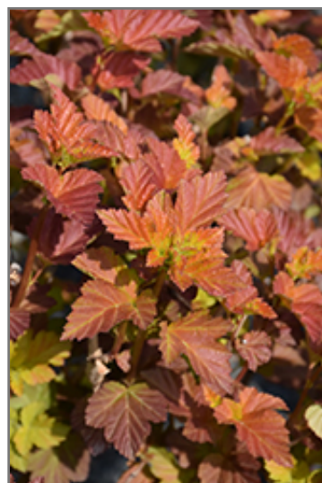
Amber Jubilee Ninebark foliage

Amber Jubilee Ninebark is recommended for the following landscape applications;