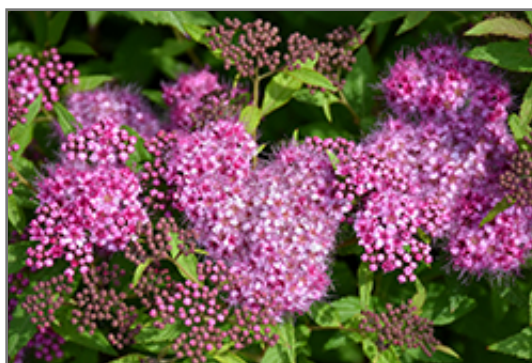
Anthony Waterer Spirea flowers