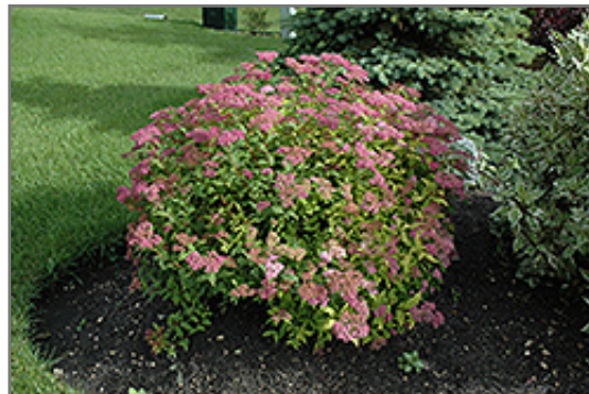
Goldflame Spirea in bloom