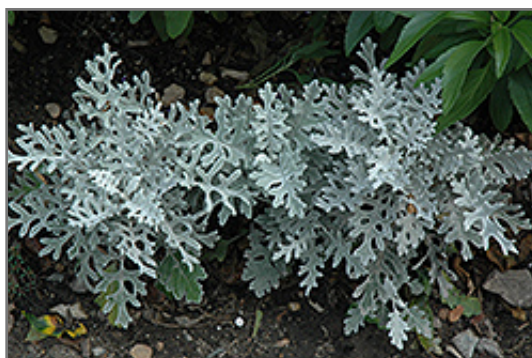
Silver Dust Dusty Miller foliage