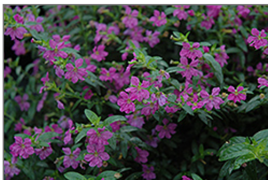
Allyson Mexican Heather flowers