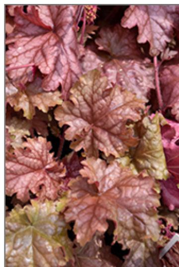
Carnival Peach Parfait Coral Bells foliage