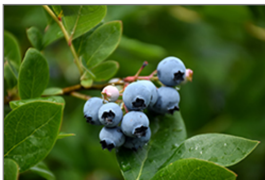
Northcountry Blueberry fruit

This is a multi-stemmed deciduous shrub with an upright spreading habit of growth. Its relatively fine texture sets it apart from other landscape plants with less refined foliage. This is a relatively low maintenance plant, and usually looks its best without pruning, although it will tolerate pruning. It is a good choice for attracting birds to your yard. It has no significant negative characteristics.