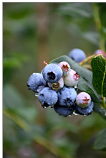
Chippewa Blueberry fruit

This is a multi-stemmed deciduous shrub with an upright spreading habit of growth. Its relatively fine texture sets it apart from other landscape plants with less refined foliage. This is a relatively low maintenance plant, and usually looks its best without pruning, although it will tolerate pruning. It is a good choice for attracting birds to your yard. It has no significant negative characteristics.