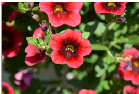
Superbells Pomegranate Punch Calibrachoa flowers