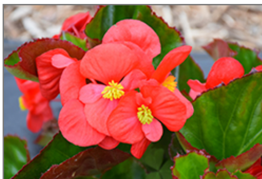
Big Red Green Leaf Begonia flowers

Big Red Green Leaf Begonia is recommended for the following landscape applications;