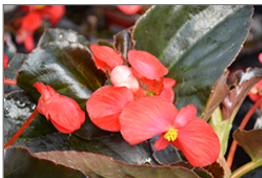
Whopper Red Bronze Leaf Begonia flowers